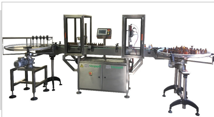
Mini line with feeding table