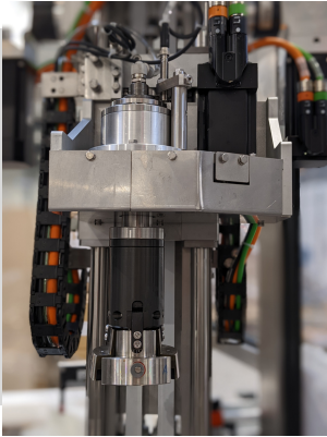
Capping head by servo motor