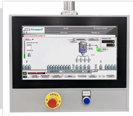
15" color touch screen